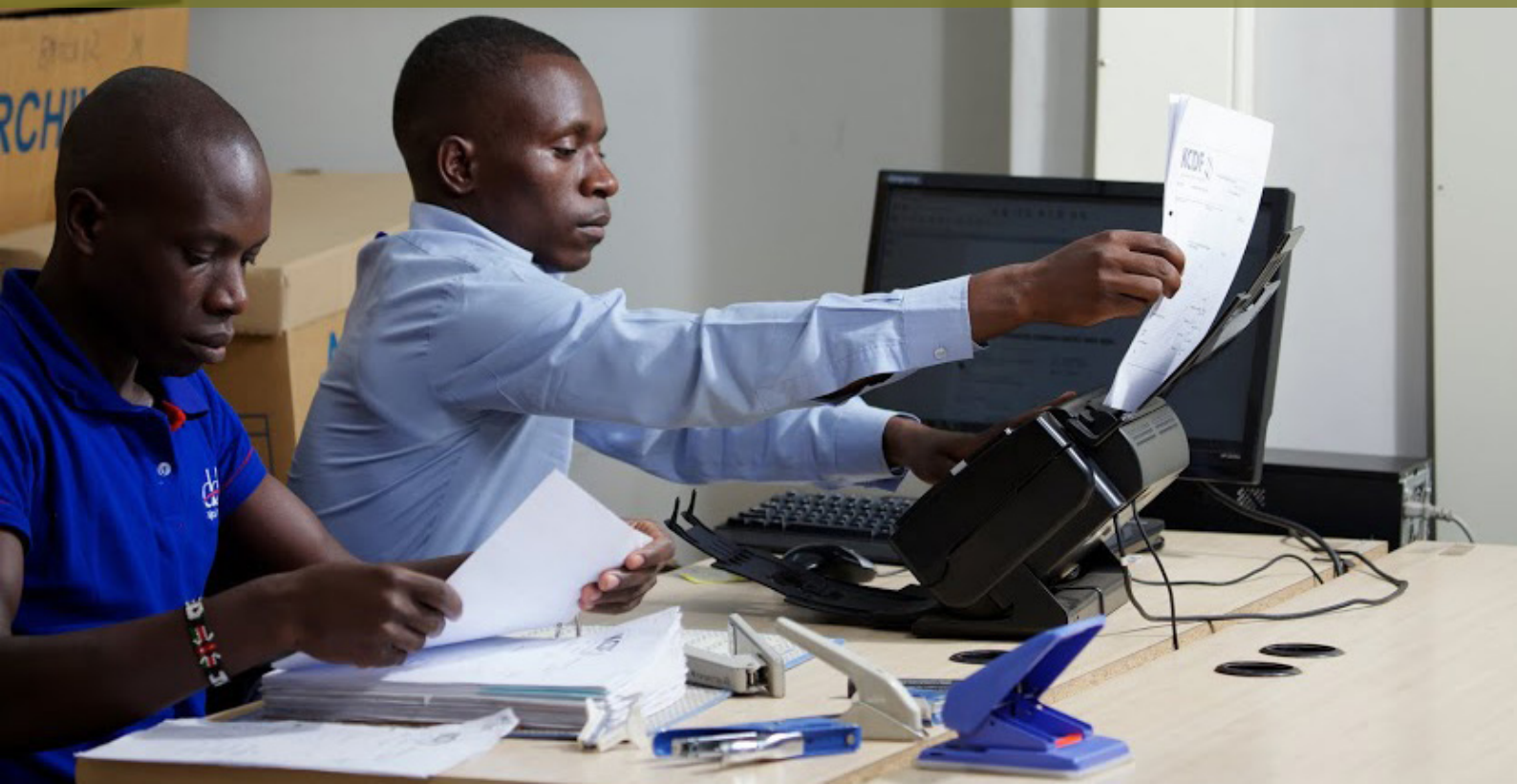
Two ICT trainees at DDD in Nairobi.

Working in collaboration with secondary schools, DDD identifies motivated graduates whose families are trapped in poverty. Recruitment focuses on youth from remote villages or slum areas in the cities, depending on the