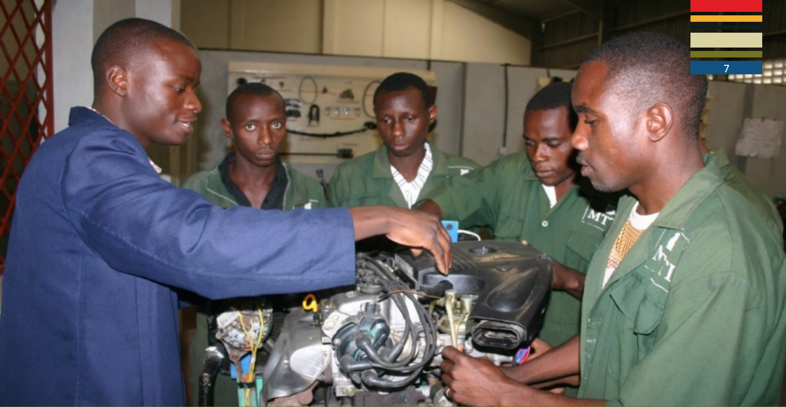
A class on motor vehicles mechanics at MTTI.

from single-parent families or from large, under privileged families. MRM also works with donors who sponsor young people from challenged backgrounds. In partnership with the Ministry of Devolution and Planning, Government social workers and the Children's Office make recommendations for admission to MTTI based on set criteria for the youth under the Street Families Rehabilitation Trust Fund (SFRTF) programme. Youth who qualify must be 18 to 24 years of age. They must also be from under privileged backgrounds, have completed at least the 8 th grade of primary education, have an interest in learning a vocation but lack the means to pursue their interest due to financial constraints, and be from remote and isolated villages where there is no tradition of skilled labour. The courses are offered at subsidised rates and at times free-of-charge.