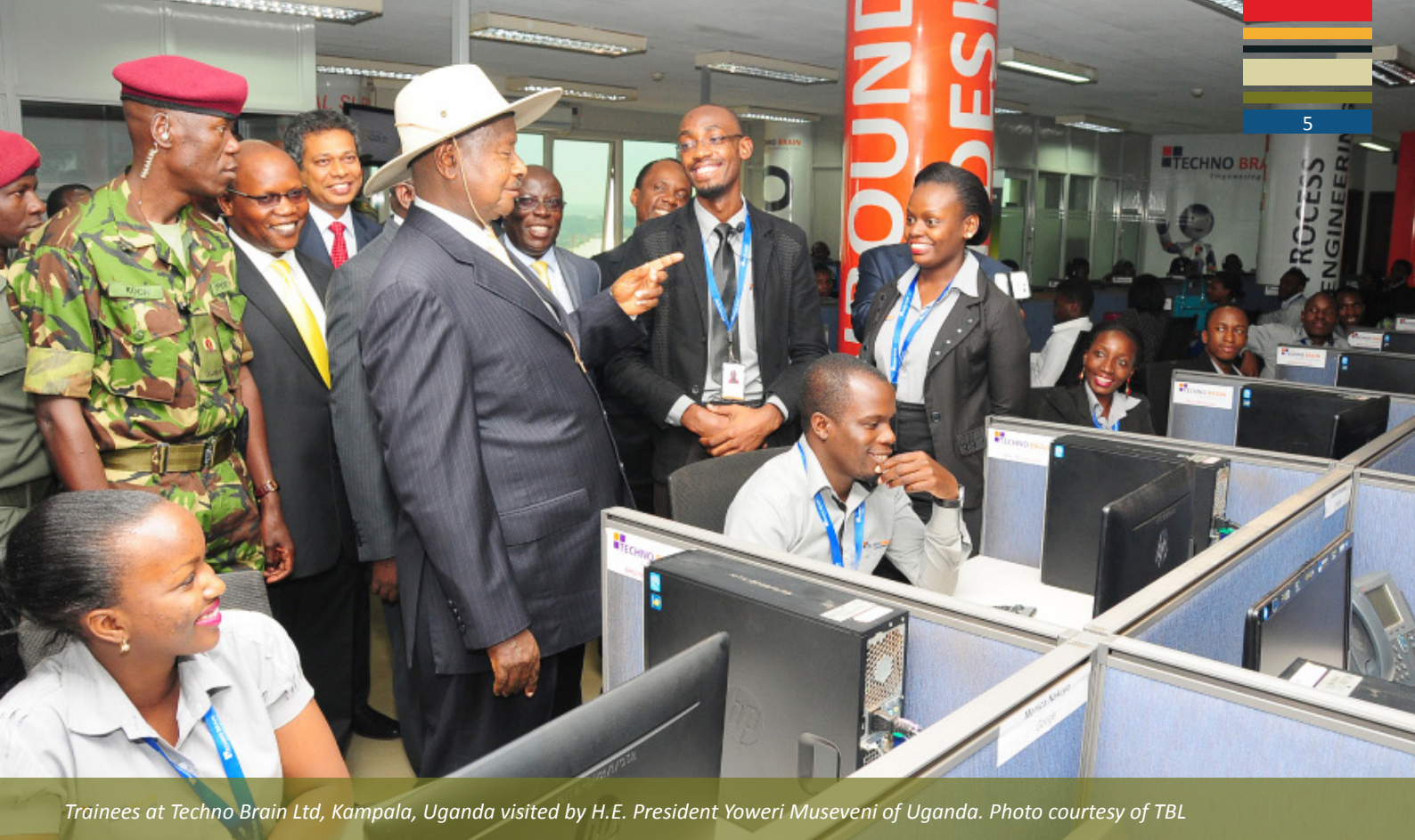
Trainees at Techno Brain Ltd, Kampala, Uganda visited by H.E. President Yoweri Museveni of Uganda.

“While it is obvious that creating jobs is essential, providing work alone is not enough to help young people move out of poverty. The young employees need career path development – which is a means to build skills of employees and create better future.”