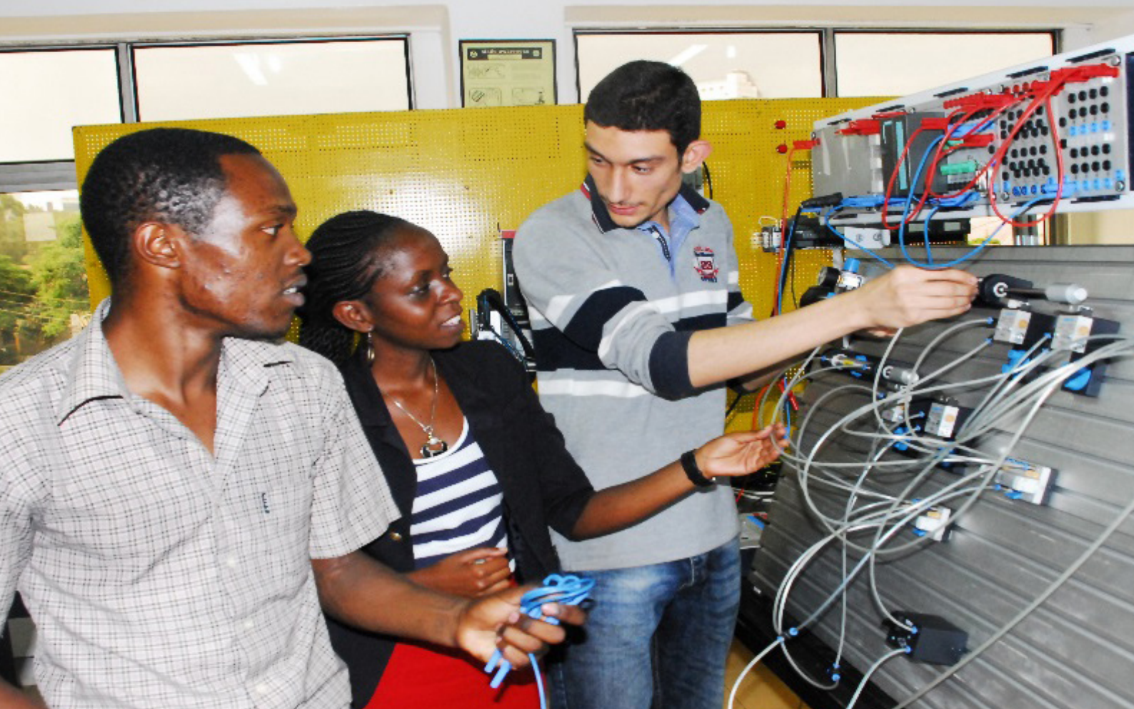
Students undergoing hands-on training on electro-pneumatics.

inadequate monitoring systems for tracking the progress of students who have completed the programme.